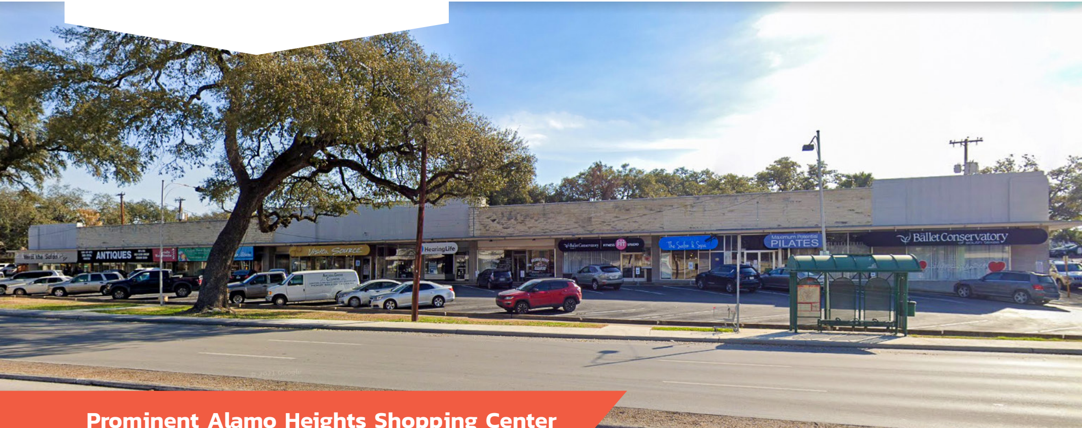
Prominent Alamo Heights Shopping Center